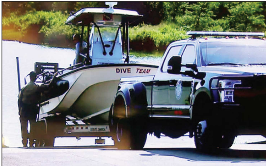
Game wardens unload a search boat Monday at Lake Ray Roberts Marina boat ramp.

Authorities have located the body of a Tioga man who drowned in Lake Ray Roberts over the weekend.