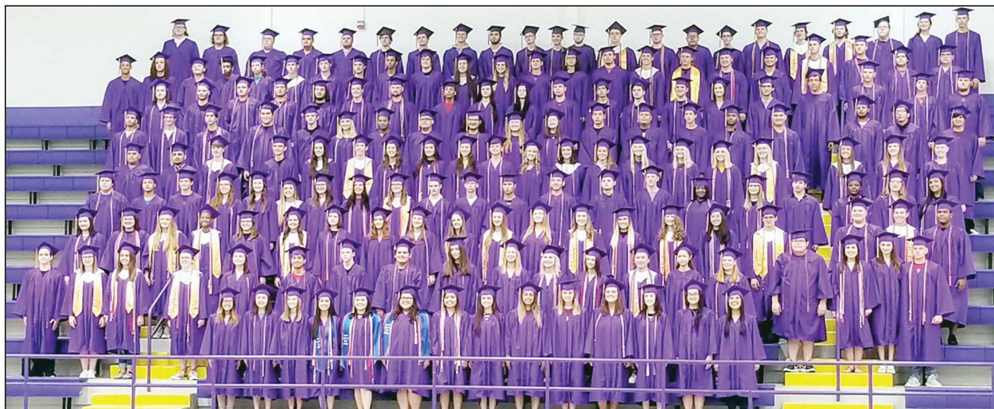
SHS CLASS OF 2019