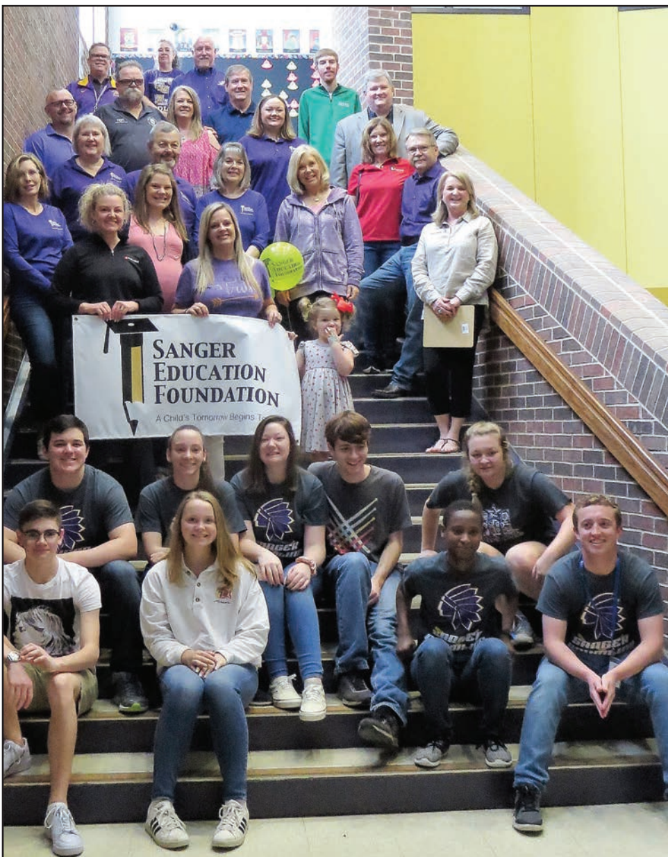
Celebrating Success through Video -SHS $15,934.88 made possible by Donor Directed Community & SEF Supporters.