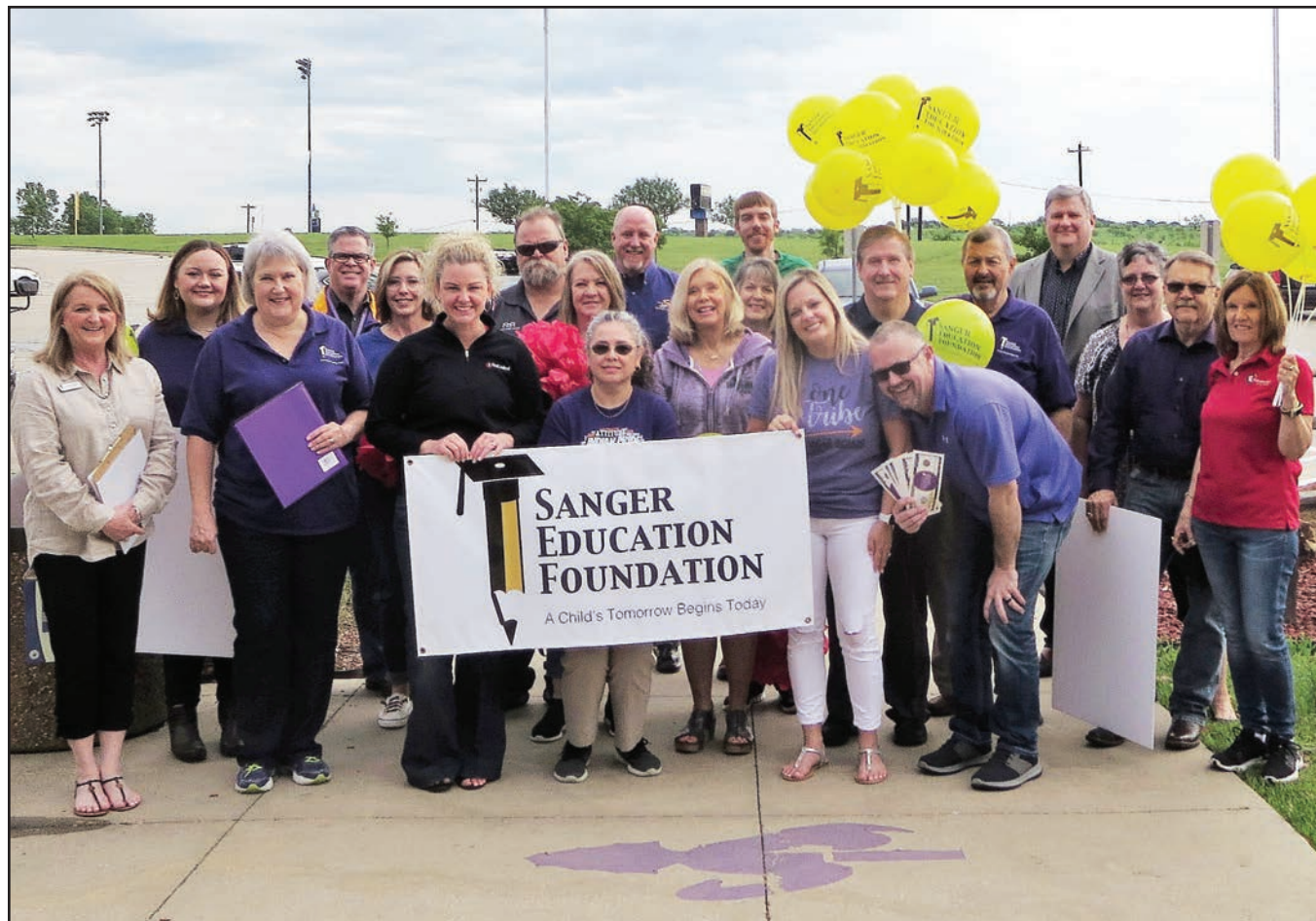
2019 Grant Patrol Participants - Full Steam Ahead – Butterfield Elementary $3515.75