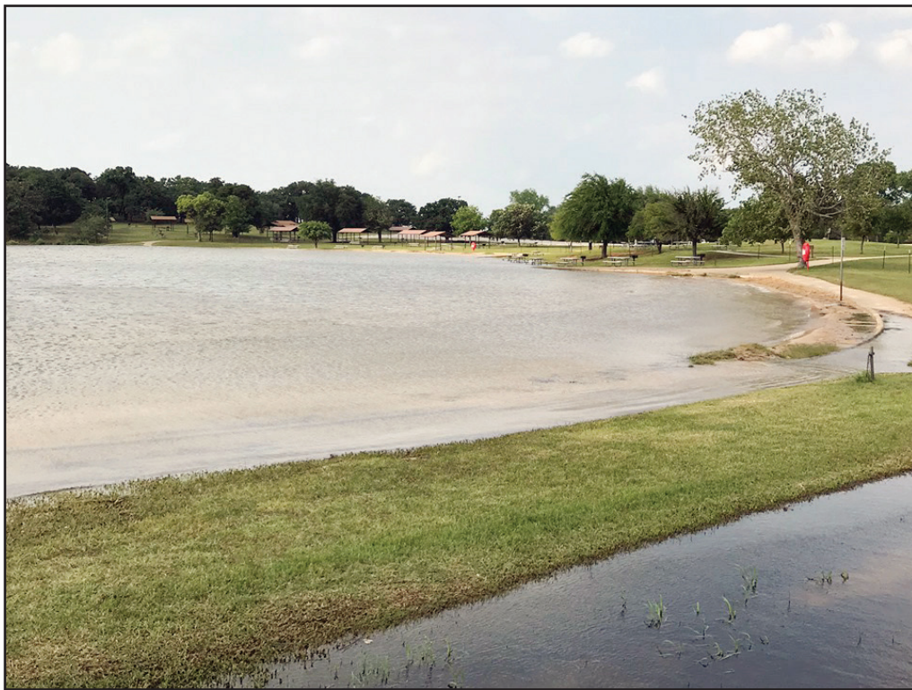
Lake Ray Roberts Isle du Bois beach area

For more specific information on sites and facilities effected, please call Johnson Branch at 940-637-2294 or Isle du Bois at 940-686-2148