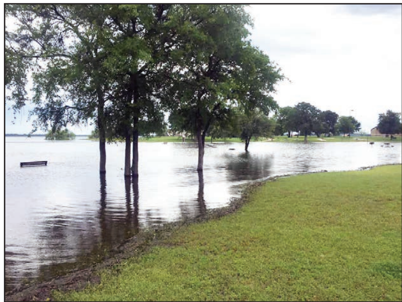
Johnson Branch beach area at Lake Ray Roberts