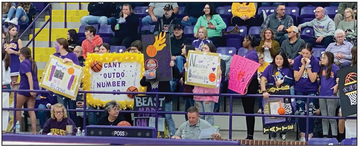
Students hold signs for the SHS varsity girls basketball team during pre-game player introductions.