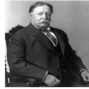
William H. Taft

Gulf, Colorado, and Santa Fe Railway began its journey towards Purcell, Indian Territory (before becoming the state of Oklahoma) to connect with the Atchison, Topeka, and Santa Fe. The Gulf, Colorado, and Santa Fe was a subsidiary of the Santa Fe Railway and continued to be operated as a separate organization. Three hundred miles of rail track was laid from Fort Worth to Purcell, Indian Territory passing through the Sanger area in 1866. The rail line was later known as the Santa Fe Railway and was